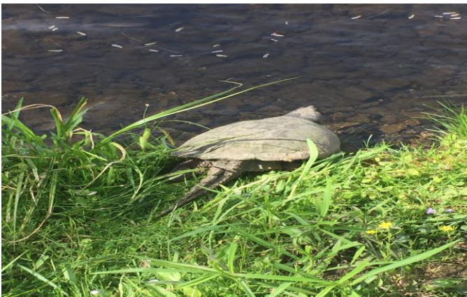
June 2015 Mud Turtle has laid her eggs.